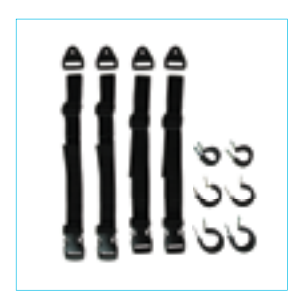
147-1602 Quick release attachment kit. Contains 4 straps with side release buckles and 4 'p' clips.