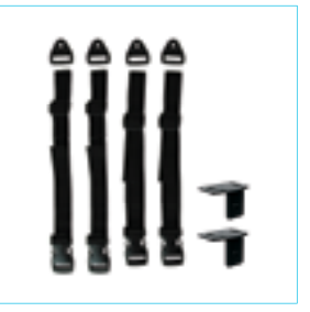
147-1604 Mobility seat base plate attachment kit. Contains 4 straps with side release buckles and 2 angle brackets.