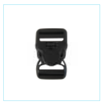
5. Security buckle sizes 3 and 4