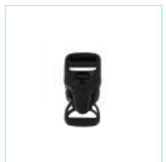
5. Security buckle sizes 1 and 2