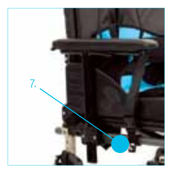
7. Attachment at 4 points