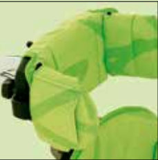
Lateral bracket assembly hardware and head-hip lateral cover