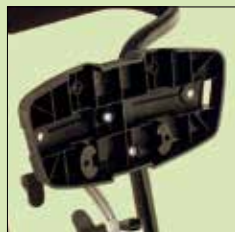
Headrest support - no cushion. Hardware only.