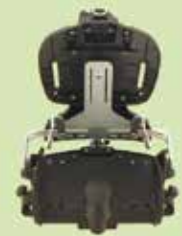
Seating system: Seat Shell

Our FREE service and support includes: Free product training Free product set up Free product assessment Free product re-assessment Free repair within 2 year warranty For service policies on all products outside warranty, please contact Leckey's Customer Service department. James Leckey Design Ltd as manufacturer with sole responsibility declares that all products conform to 93/42/EEC guidelines and EN12182 technical aids for disabled persons general requirements and test methods. Order forms and spare parts lists to extend the service life of the product and allow reissue are available on request or online at www.leckey.com .