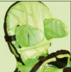
1" Spacer pad & laterals and 1" Spacer pad only