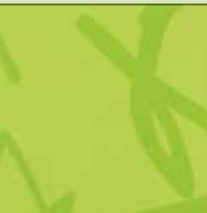
Seat covers Green