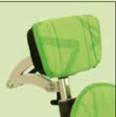
Flat headrest cushion Does not include hardware