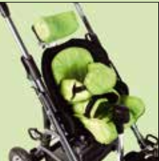
Cosyshell (does not include covers)