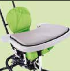
Padded tray insert