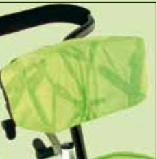
Contoured headrest cushion Does not include hardware