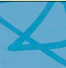
Seat covers Blue