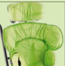
Shoulder support assembly and shoulder support cushion