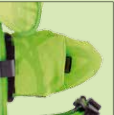
Flip-away lateral support hardware and lateral support covers