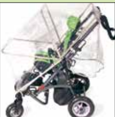
Raincover (for use with stroller only)