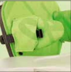
Rigid lateral support hardware and alateral support covers