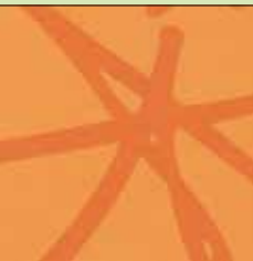
Seat covers Orange