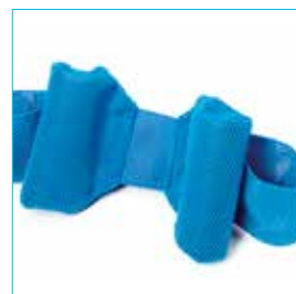
LAB/1/C Head support