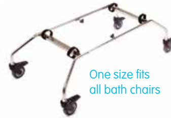
One size fits all bath chairs