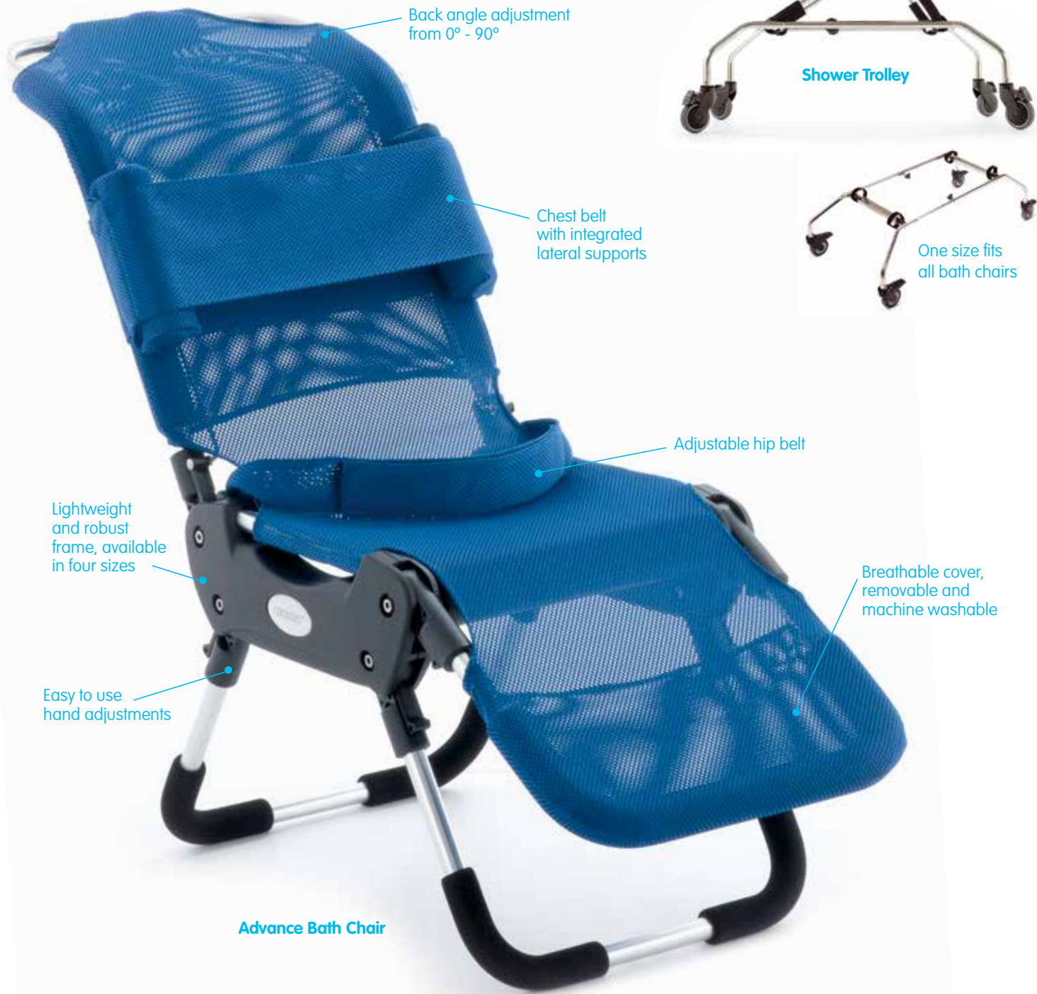
Advance Bath Chair