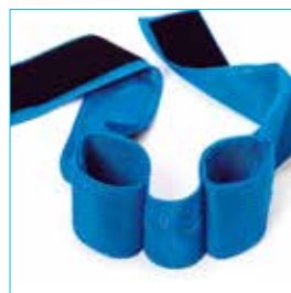
LAB/#/B Abduction Belt