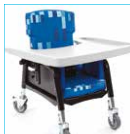
Height adjustable tray