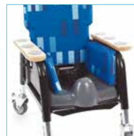
Potty insert for Easy Seat