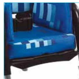
Seat pad for Easy Seat