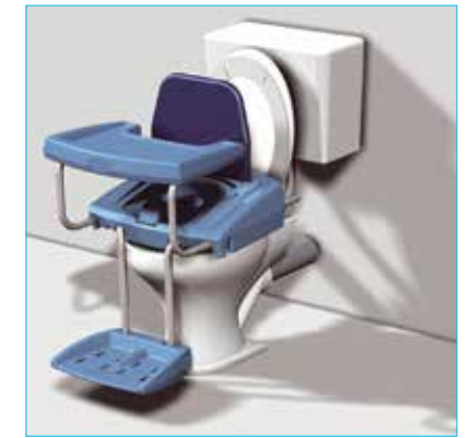
Over toilet seat

The seat can be simply removed from the standard toilet, as and when required.