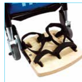
Footplate With sandal straps